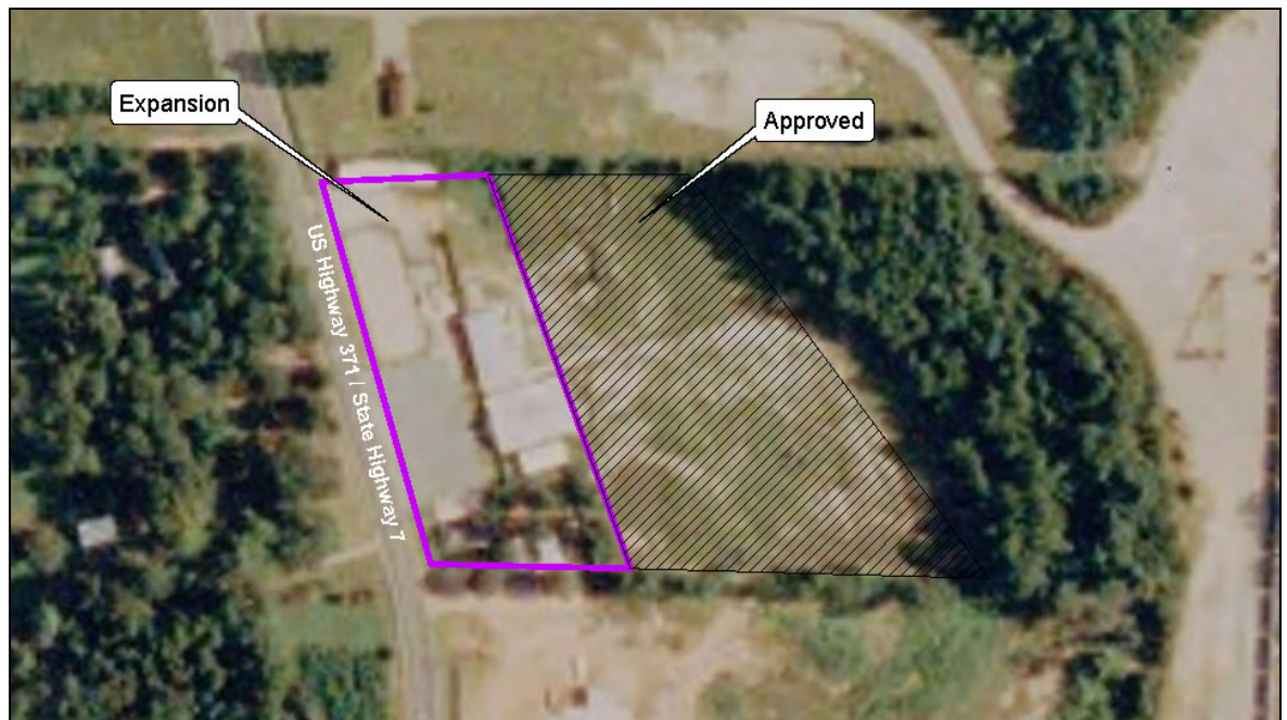
Figure 1. Sibley Yard (Approved) and Sibley North Yard (Expansion)